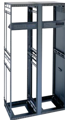
SP-5-43 (262-652) side panel

The Slim 5 rack enclosures are built using a proprietary bolt-together design which can be shipped knocked-down via UPS. As strong as a welded cabinet, each enclosure is equipped with 2 pairs of fixed 11-gauge, #10-32 threaded rackrail front and rear, and features heavy-duty 14-gauge (.078") steel top and bottom, as well as 1/2" and 3/4" rear electrical knockouts. Capable of being ganged together with or without an optional cable chase kit. Slim 5 racks are complemented by a number of available options offering added versatility and aesthetic appeal. Also includes accommodations for the PD series of vertical AC power strips (PB-5A bracket required). 19-1/8" overall width, 20" deep. Optional steel side panels and casters available.